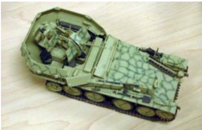
Flakpanzer from the July ASMS meeting.